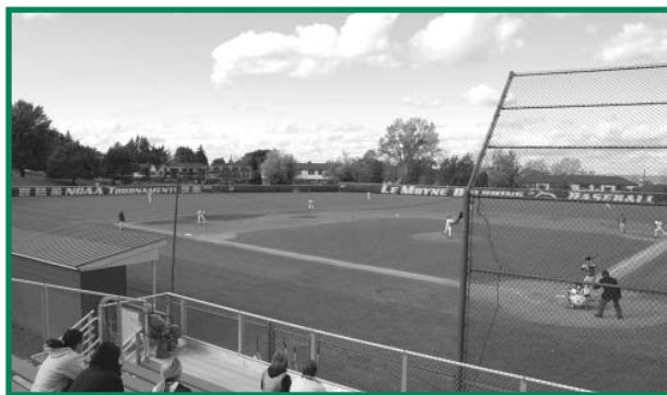
ROCKWELL FIELD HOME OF THE DIVISION I DOLPHINS

The Steve Owens Baseball Camps are designed to give the young baseball player an opportunity to develop and improve his baseball skills, while at the same time providing him with an enjoyable week on a college campus. An experienced and enthusiastic coaching staff will teach all of the fundamental skills that are necessary to develop into a better baseball player. Game playing is also an important part of the camp as it will allow the individual to put into play the skills developed throughout the week. While specializing at one position for instruction, games will allow each player the opportunity to work out at other positions. The focus of the camp will be on player development and improvement. No written evaluation is provided.