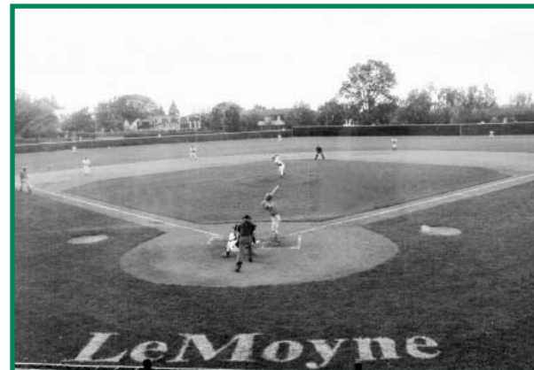
LIVE GAME PLAY

While the Camp being conducted as an educational program is located on the Le Moyne College campus, Le Moyne College is not responsible for operation of the Camp.